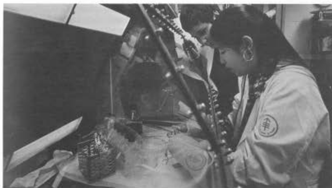
For the last 35 years, a special relationship has existed between the Sloan Foundation and the institution now known as Memorial Sloan-Kettering Cancer Center. Grants over that period of time to Sloan-Kettering, plus personal gifts from Alfred P. Sloan, Jr., total $67 million. Sloan-Kettering is now supported by many organizations and individuals and is the largest private institution in the world for the treatment of cancer and for cancer-centered research and training. (Above) Tissue specimens are subdivided and prepared for tissue cultures in a completely enclosed safety cabinet; and (below) a research nurse prepares tests for surgery patients in an anesthesia laboratory — surgery is being performed in the background.

Many but by no means all of the grants to Sloan-Kettering came from a special fund within the Foundation called the General Motors Dealers Apprecia-