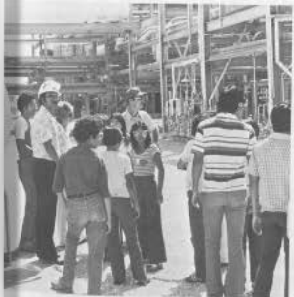
Texas Alliance for Minorities in Engineering

Special activities designed to reinforce the interest of secondary-school students in engineering careers are a feature of the programs of regional minority engineering consortia around the nation. Engineers from industry visit students; students visit industrial facilities; and projects like building intricate wooden structures instill understanding of engineering principles.