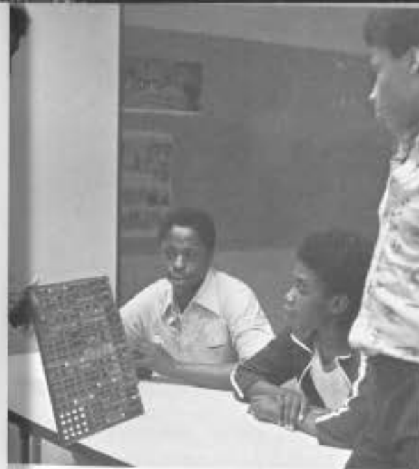
Massachusetts Pre-Engineering Program for Minority Students

• In 1975 the Committee on Institutional Cooperation, an academic consortium based in Evanston, Ill., established with the Foundation's encouragement the Midwest Program for Minorities in Engineering. Including some institutions not members of CIC, the program is known as CIC + MPME and embraces 17 engineering schools: those on 13 campuses of the Big Ten universities plus the Illinois Institute of Technology, the University of Detroit, the University of Notre Dame, and Wayne State University. The member institutions, individually and in various combinations, conduct ten pre-college programs designed to increase the number of well-qualified minority matriculants at schools of engineering.