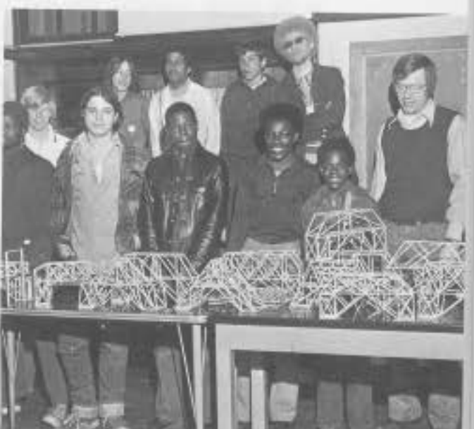
Philadelphia Regional Introduction for Minorities to Engineering