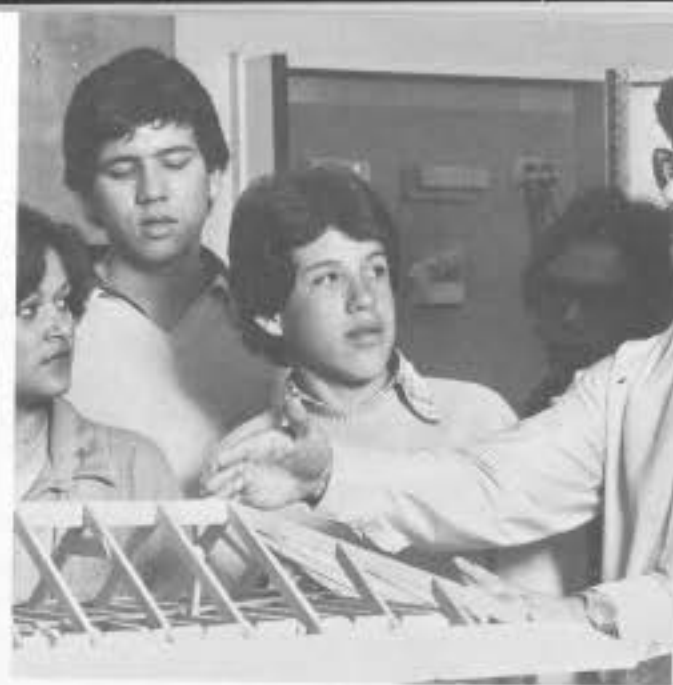
Mathematics, Engineering, Science Achievement (California)

Special activities designed to reinforce the interest of secondary-school students in engineering careers are a feature of the programs of regional minority engineering consortia around the nation. Engineers from industry visit students; students visit industrial facilities; and projects like building intricate wooden structures instill understanding of engineering principles.